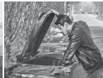
Take out the rubbish