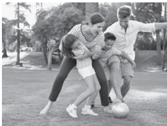
Go to the park