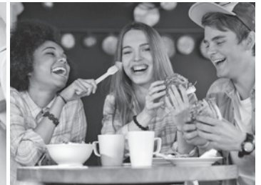
Hang out with friends