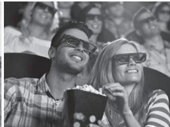
Watch a film