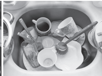
Do the dishes