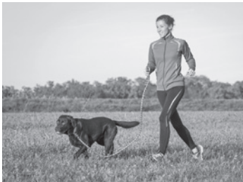
Walk the dog

1 Look at the pictures. Write angry , bored , excited or happy according to how you feel about them. Then work with a partner. Discuss how you feel when you do these activities. Have you got the same opinion?